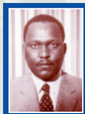
Paul Ngei: led APP.