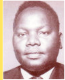
Mati: Was the first African Speaker of the National Assembly.