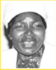
Grace Ogot: One of the few women to become an MP.