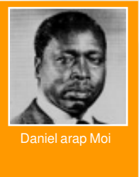
Daniel arap Moi