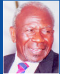
Moody Awori: Leader of Government in the 9th Parliament.

The Kenyan Parliament, modelled on the Westminster one, has adopted the position of Leader of Government Business to safeguard Government policy and interests by defining what is discussed, how and when. But contributions in the House by the Leader of Government do not necessarily reflect Government policy. The Leader of Government Business must also take cognisance of the presence of the Opposition. She or he works towards enhancing harmony in the House. The Leader of Government Business in the House works closely (though informally) with the Leader of the Official Opposition , especially in House matters requiring a non-partisan approach. The Chief-Whip and his or her deputy complement the Leader of Government Business in his or her other duties.