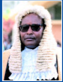
Francis Ole Kaparo Speaker: 8th and 9th Parliaments.

From the moment of his or her election, the Speaker of the House reigns supreme within the precincts of Parliament . The Speaker of the House is the representative of the House itself, its powers, privileges and immunities. The holder of the post of Speaker is the spokesperson or representative of the House in its relations with the President of Kenya and other authorities and persons outside Parliament. The Speaker presides over debate in the House. He enforces compliance to all the rules of procedure in the Chamber and within Parliament's precincts. The Speaker communicates resolutions made by the House to those at whom they are directed. The Speaker conveys the pleasure of the House, expresses its censure, reprimands and admonishes.