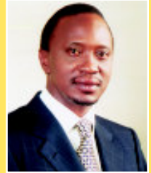
Uhuru Kenyatta: Leader of Official Opposition in the 9th Parliament.

The Leader of the Official Opposition of the House is the person the party that has the majority of Opposition MPs in Parliament chooses to be its leader in the House. The MPs in her or his party must be at least 30. Although there is no Constitutional or legal provision for this position (nor is it included in the Standing Orders), it has grown to be central to the working of Parliament. The Standing Orders do, however, mention the Official Opposition Party. The salary and house allowance of the Leader of the Official Opposition is higher than that of other Members of Parliament. The Leader of the Official Opposition communicates either directly to the Leader of Government Business or through the Chief Whip.