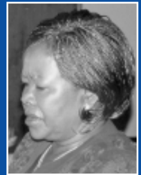
Nyiva Mwendwa: First woman Minister.

There is clear need to turn this tide. Gender concern with regard to Parliament must be fast-tracked to achieve the required change. It is noteworthy, too, that there have been very few women journalists covering politics and Parliament. Women have generally tended to cover what are considered to be “women’s issues”. These have generally been taken to be concerns like fashion, beauty and how to look good, children, food and nutrition, house care and home keeping, domestic shopping and the like. It is important for women journalists to break through the glass barrier that has confined them into this narrow territory. A bold leap of faith is essential on the part of each female journalist.